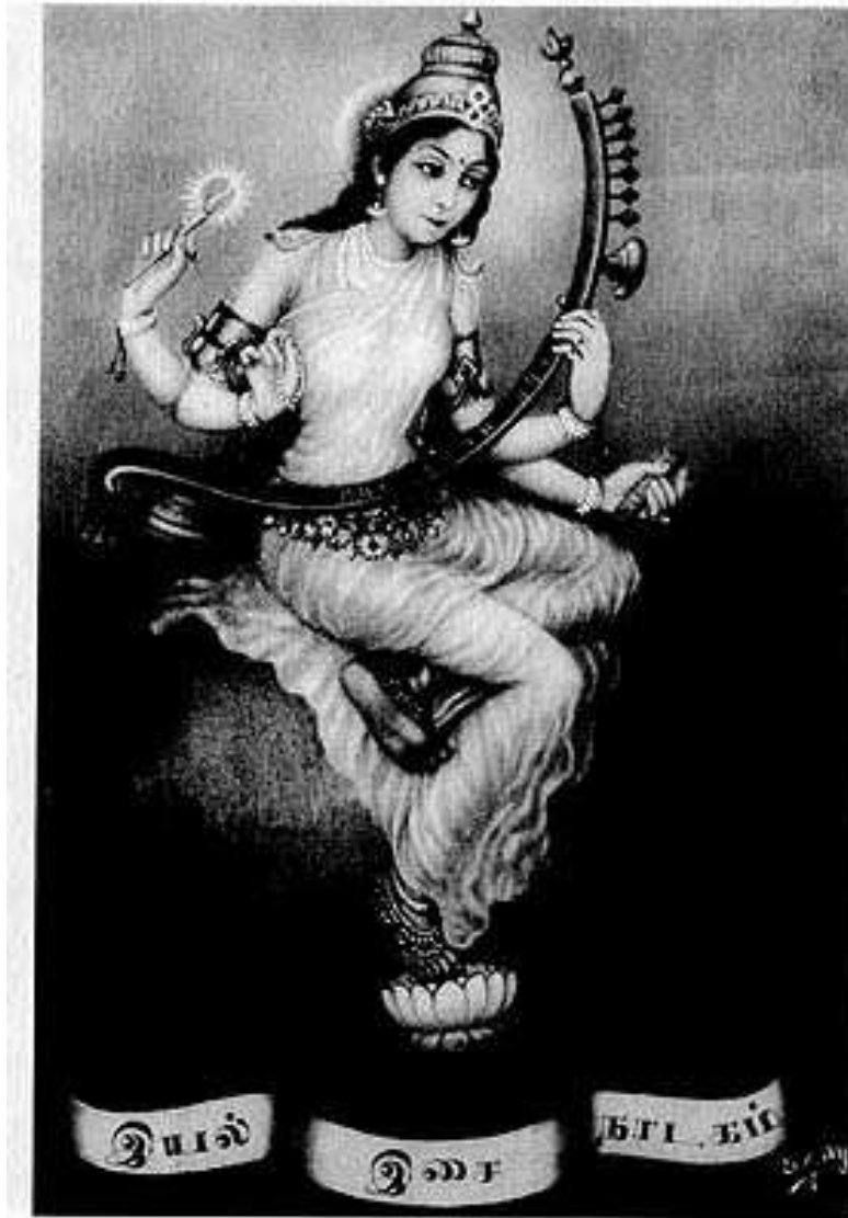
Figure 2. "Tamilttāy." Color poster, c. 1941. Courtesy Kamban Kazhagam, Karaikkudi.