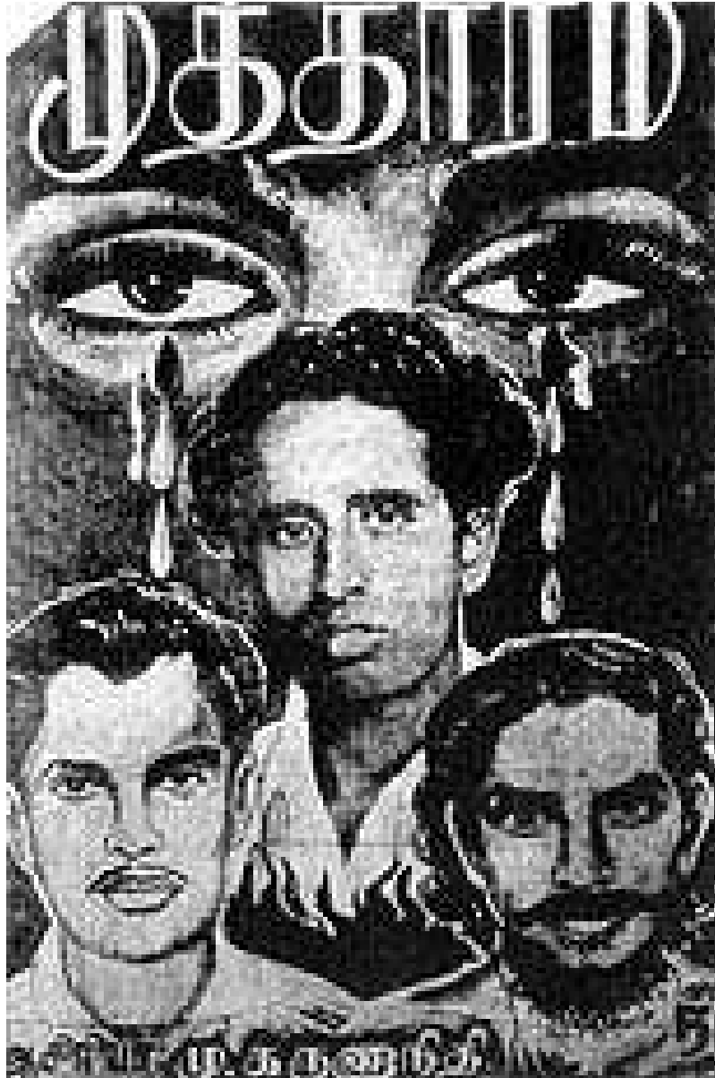
Figure 7. Tamilttāy sheds tears over Chinnasami, Sivalingam, and Aranganathan. Cover of Muttāram , 15 March 1966.