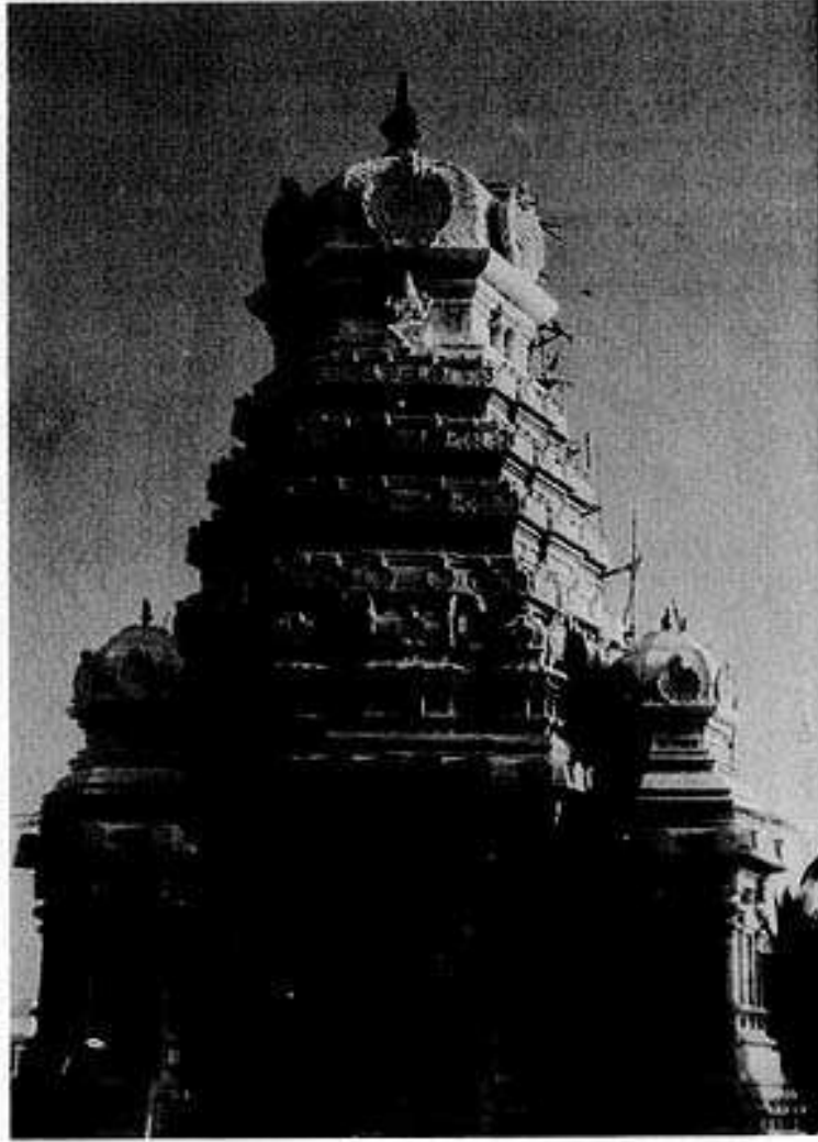
Figure 12. Tamilttāy's temple, Karaikkudi. Photograph, 1993. Courtesy Kamban Kazhagam, Karaikkudi.]