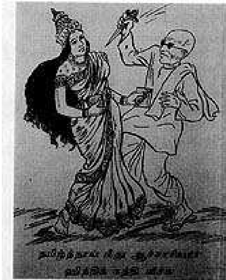
Figure 5. "Rajagopalachari Hurls the Knife of Hindi at Tamilttāy." Cartoon, Viṭṭalai, 18 May 1938.