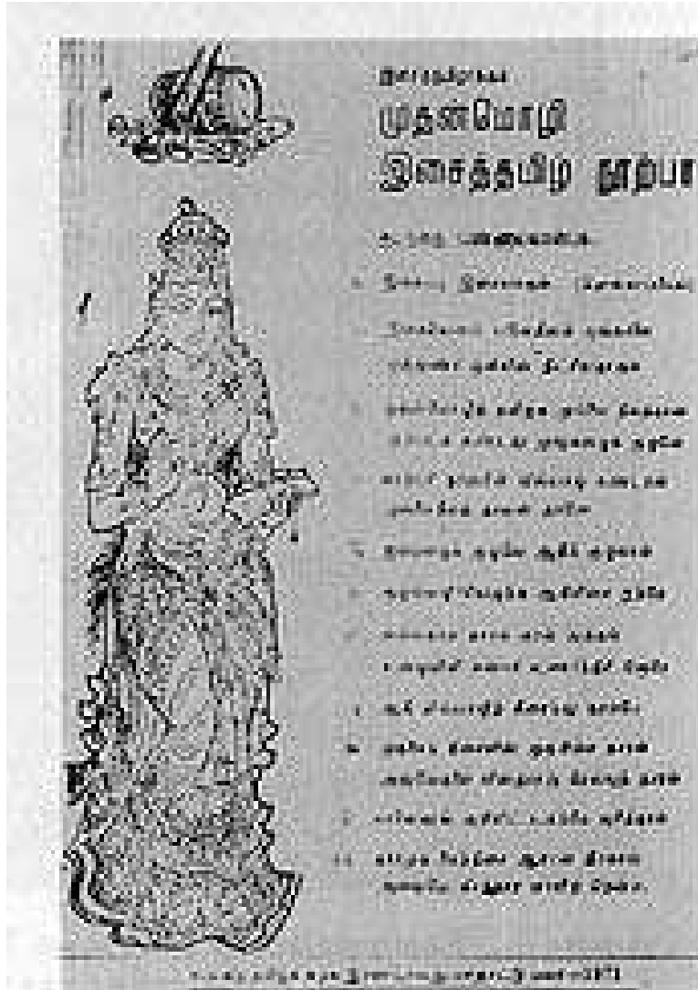
Figure 8. Poem on Tamil with drawing of female figure, presumably Tamilttāy, 1971. Souvenir of second conference of Ulakat Tamilk Kajakam (World Tamil Association), 1971.