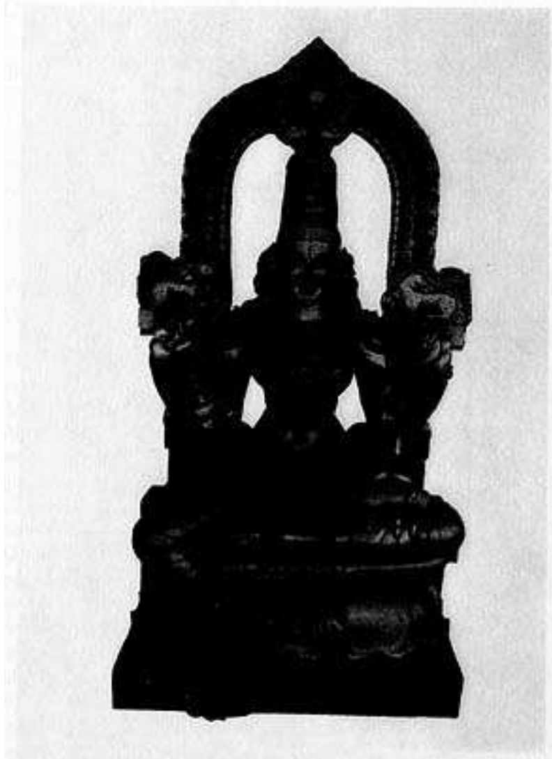
Figure 11. Tamiḻttāy. Statue in her temple in Karaikkudi, 1993.