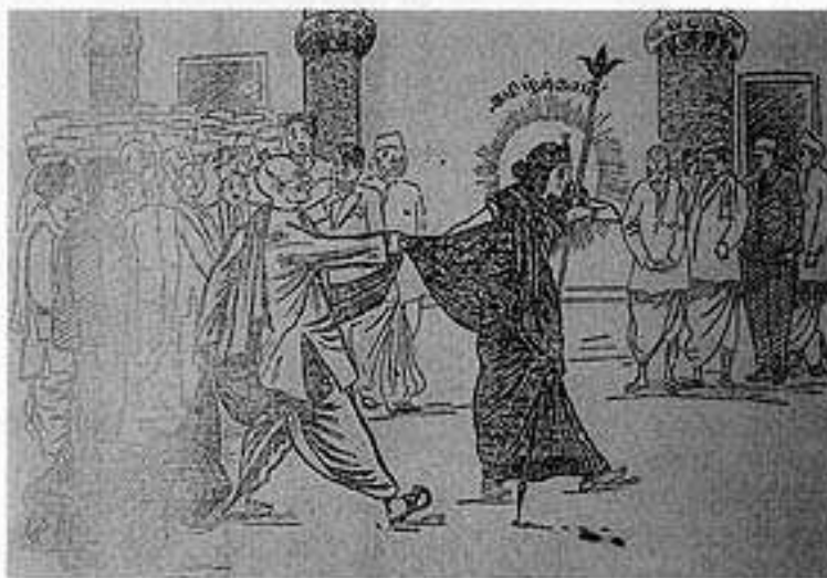
Figure 6. "Rajagopalachari's Bravado: The Dishonoring of Tamilttāy." Cartoon, Kuṭi Aracu, 19 December 1937.