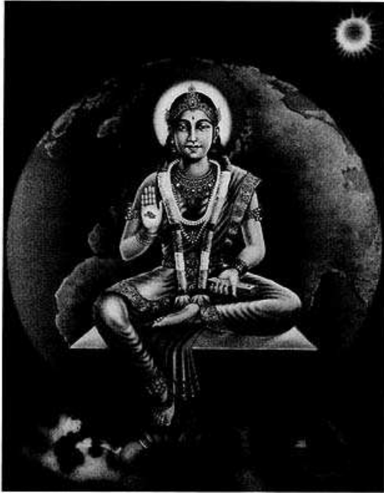
Figure 1. "Tamilttāy." Color poster, 1981.]