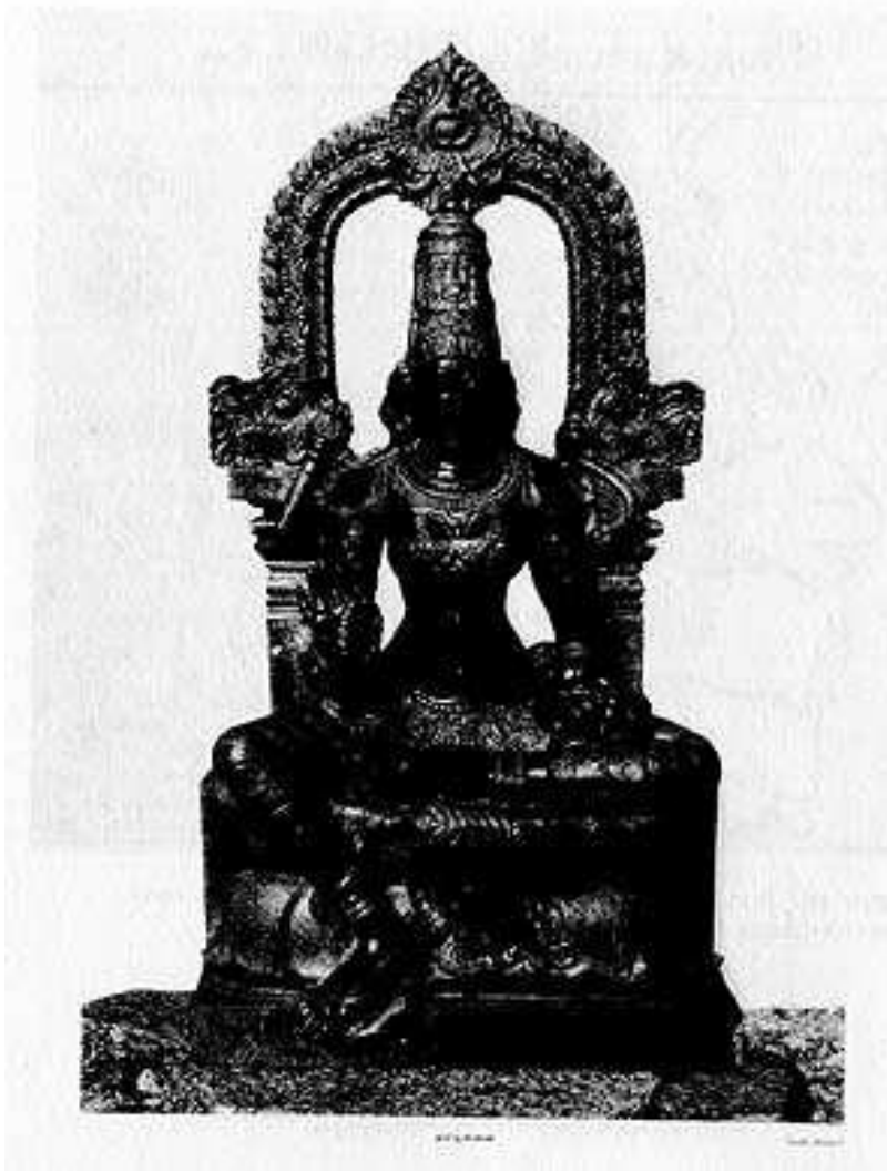
Figure 9. "Tamiḷaṇṇai." Official government of Tamilnadu poster, 1987. Tamil Arasu Press, Madras.