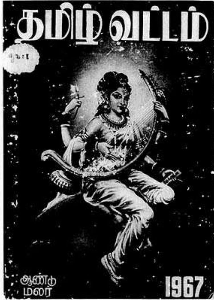
Figure 3. Tamilttāy . Cover of the literary journal Tamiḷ Vattāṁ , 1967.